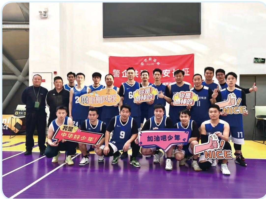
Group photo of the 2023 SRE Group Police and Enterprise Union Cup Basketball Competition 2023年上置集團警企聯誼盃籃球比賽合影

2023年，集團人力資源條線開展了「定崗位、定編製、定薪酬」三定工作，幫助集團及各項目公司優化人員配置，完善薪酬體系，實現人力資源數量與素質的合理配置。