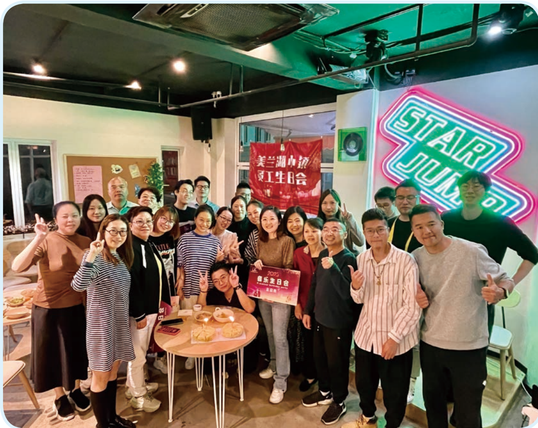
The staff birthday party (Q3 and Q4 2023) held by Meilan Lake Town Enterprise Management Co., Ltd.* (美蘭湖小鎮企業管理有限公司) in November 2023 2023年11月美蘭湖小鎮企業管理有限公司第三季度、第四季度員工生日會

2023年9月，上置集團與美蘭湖小鎮公司開展了內部籃球比賽，幫助員工強身健體的同時增強了集團內部員工凝聚力；2023年12月，警企聯誼杯籃球賽在綠洲中環中心舉行，上置集團代表隊與普陀區長征派出所通過體育交流，深化警企合作關係。