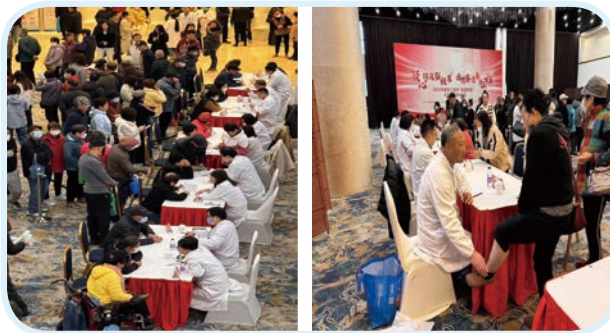
Convention Centre hosted large-scale government free clinic activities 會議中心承辦政府大型義診活動