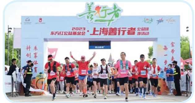
Lake Malaren Town jointly held the 2023 Shanghai Charity Hiking Activity 美蘭湖小鎮聯合舉辦2023上海善行者公益徒步活動