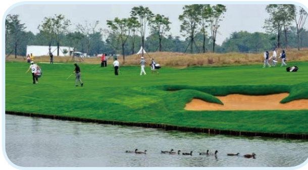
The Golf Course is a place where human and nature coexist peacefully 美蘭湖球場 - 人與自然和諧相處

In addition, the Golf Course has established a sophisticated water purification system, in which water from sprinkler irrigation and rainwater could flow back to the lake after being filtrated through multiple layers of sand and soil. The optimised ecological environment makes the Golf Course a habitat for the surrounding small animals like magpies. Due to the large lake surface of the stadium and the long shoreline of the lake, there is always a collapse of the shore embankments. Proactive repair is also performed in the stadium to ensure clean environment and no impact on water resources.