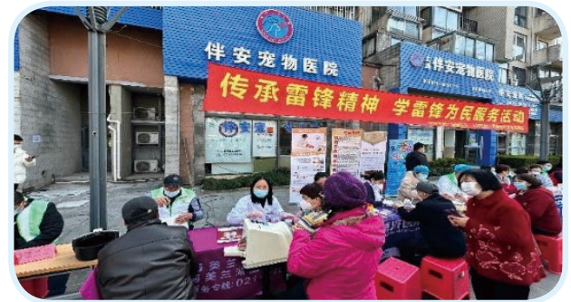
Obstetrics and Gynaecology Hospital participated in the “Learn from Lei Feng” public welfare activity of Luodian Party Branch 婦產科醫院參與羅店黨支部「學雷鋒」公益活動